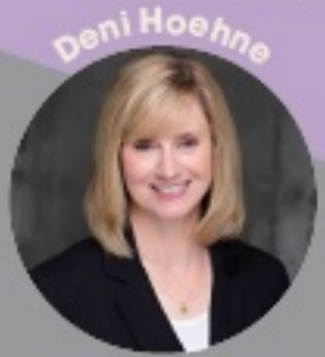
Winco Foods Employee Engagement November 9th