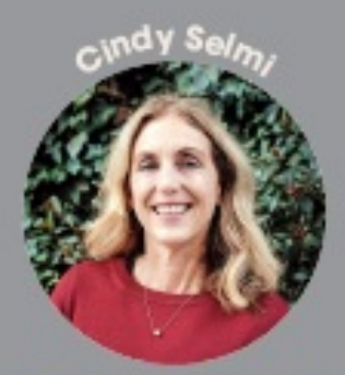
Health Outreach Partners Organizational Self-Care Assessment Tool