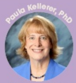
Idaho Business for Education Building your Talent Pipeline through Apprenticeships